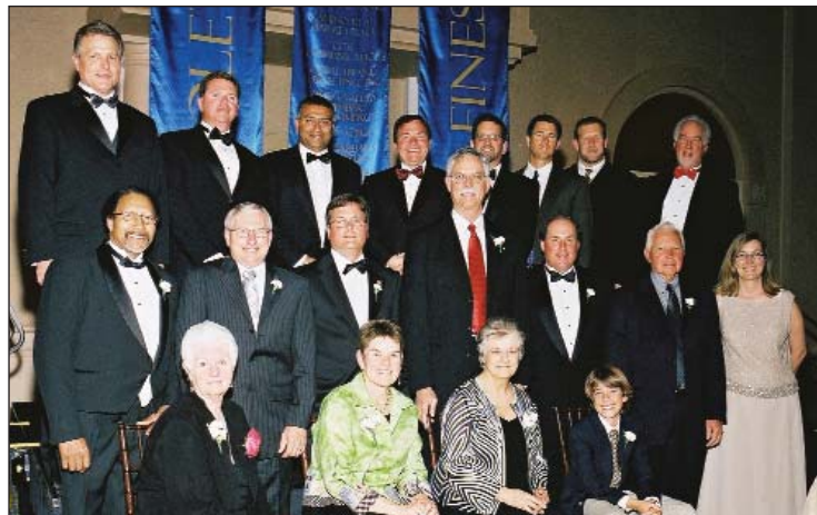
Presenters and recipients gather for a group photo after the 2005 Goleta's Finest Awards held at Bacara Resort & Spa.

Festivities for the evening include a Silent Auction benefiting the Goleta Education Fund, cocktails, dinner, the awards ceremony